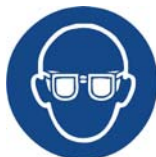
Tightly sealed goggles