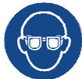
Tightly sealed goggles